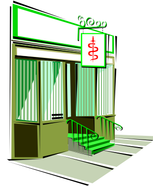
Raleigh location of ABC Healthcare

Dr. Jones has two options for reporting Patient Volume using individual methodology for a single location: