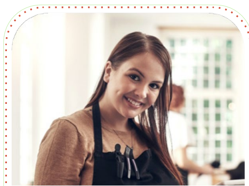
Smiling stylist holding digital tablet