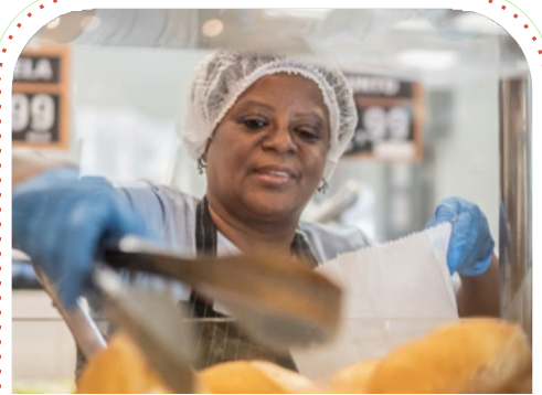
Bakery worker prepares an order